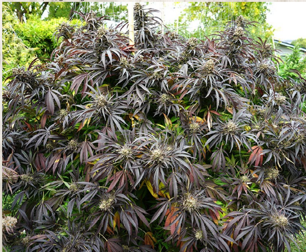
White Runtz (fast) growing outdoors

“Fast” or “Quick” cannabis seeds by Humboldt Seeds are photo-dependent strains with a fast flowering phase, which means they flower between 1 - 2 weeks faster than the standard versions. Humboldt Seeds’ Fast genetics have been created from the cross of their classic strains with their best autoflowering varieties. Fast strains are ideal for impatient growers eager to obtain quicker harvests, as well as for growers in northern areas with adverse weather conditions. Fast strains are perfect for anyone wishing to grow our classic Humboldt genetics while retaining all their top qualities — and finish in mid-September!